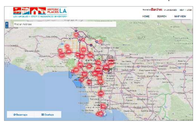
Map View of HistoricPlacesLA.org, powered by Arches v3.0, showing clusters that represent over 25,000 heritage resources identified to date by the City of Los Angeles.

It is anticipated that the Arches open source community will add and share functionality to meet other needs of the heritage field. In addition, the Arches community provides support in the installation and use of Arches. For more information, visit the Arches project website (archesproject.org) where along with participating in the community forum, visitors can interact with an online demo, download the code, access documentation, review the project roadmap, receive project updates, and much more.